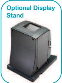
Optional Display Stand