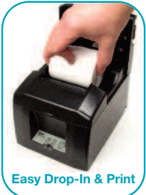
Easy Drop-In & Print