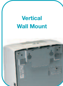
Vertical Wall Mount