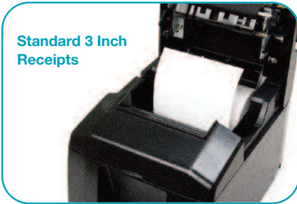
Standard 3 Inch Receipts