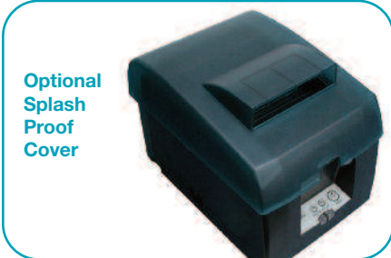
Optional Splash Proof Cover