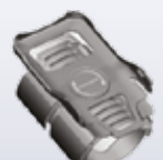
• Wearable Holder

For full accessory range please refer to M30-35 accessory guide*